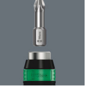
Rapidaptor technology makes the tool adaptable since bits and sockets can be exchanged rapidly.