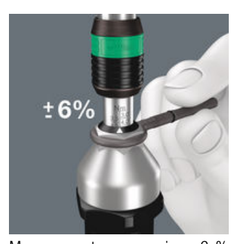
Measurement accuracy is \pm 6 % (article 1430: \pm 10 %) in accordance with the standard DIN EN ISO 6789. Distinctly audible and noticeable excess-load signal when the pre-set torque is reached.