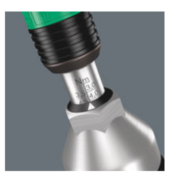
Easy-to-read scale value.

Simple setting of the required torque by hand.