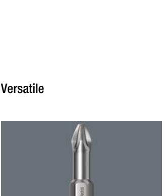
Unlimited torque for loosening seized screws.